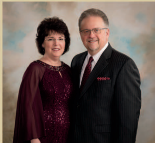
Galloway and Co