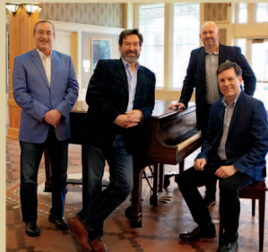
No Name Quartet