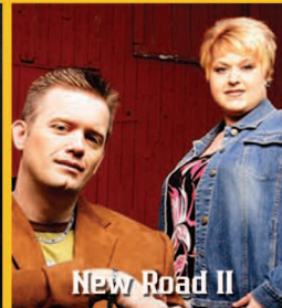
New Road II