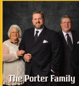
The Porter Family