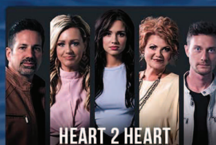
HEART 2 HEART