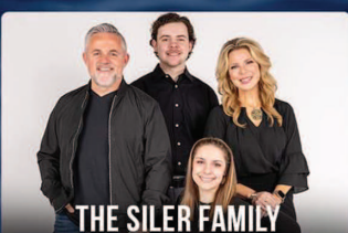
THE SILER FAMILY