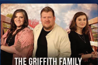
THE GRIFFITH FAMILY