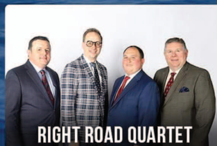
RIGHT ROAD QUARTET