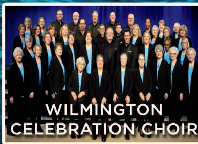
WILMINGTON CELEBRATION CHOIR